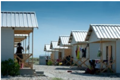
New Homes for Haiti

CARREFOUR, HAITI – Quality Systems, Inc. (QSI) announced today that the PERMA•CRETE® product line is being used in the country of Haiti by its PermaCrete Ayiti distributor to resurface the exteriors of thousands of small new houses being built in this country by various relief agencies to provide shelter and living quarters for the homeless people of Haiti who have endured squalid conditions since the devastating earthquake a year ago destroyed over 300,000 residences and commercial buildings.