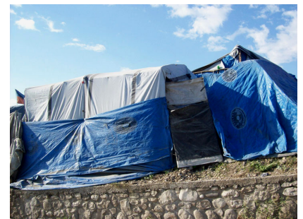
Existing Haiti Shelters

The PERMA•CRETE® product line, distributed worldwide by over 1,000 Dealers, has gained considerable recognition over the past twenty years as a premium polymer-concrete surfacing material used on commercial and residential buildings as well as for vehicular and pedestrian traffic areas, including interstate highway bridge surfaces.